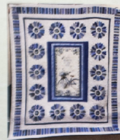
2024 Raffle Quilt

Location: The Stone Family Center 613 Cherry St, N Wilkesboro, NC 28659